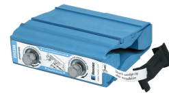
wedge og wedgekit

For merne information, besøg venligst roxtec.com .